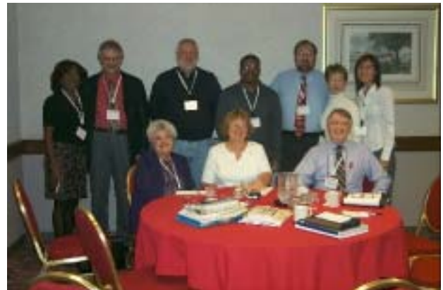
Pennsylvania Delegation at the Project Citizen Conference in St. Louis